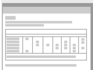
Table 1 - Numbers of hematopoietic SCTs in Europe in 2007 by indication, donor type and stem cell source.

All participating teams were requested to report their data for 2007 by indication, stem cell source and donor type as listed in Table 1 . Data were validated by three independent systems: through confirmation by the reporting team that received a computer printout of the entered data, by selective comparison with MED-A data sets in the EBMT ProMISE data system and by cross-checking with the National Registries. Onsite visits of selected teams were part of the quality control program ( www.jacie.org ).